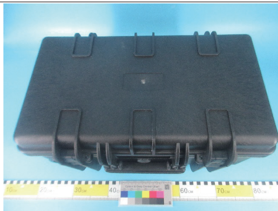
Original sample A